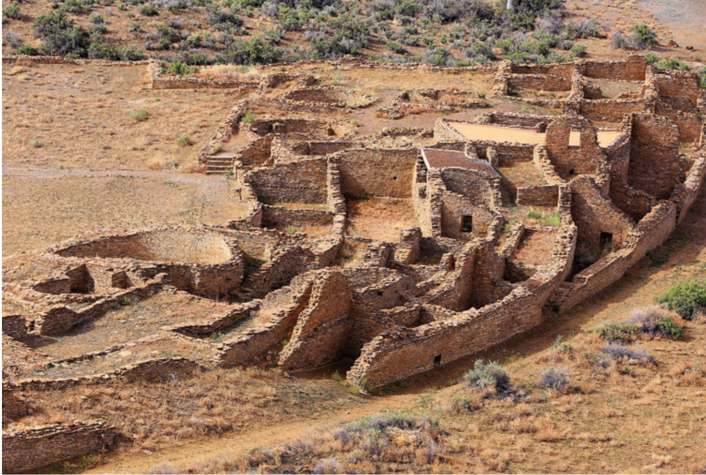
Right: Chaco petroglyphs number in the thousands, featuring anthropomorphic and zoomorphic figures, abstract spirits, and spiral symbols. Top: An aerial view of Pueblo Bonito reveals its distinctive D-shape. Part housing and part storage, it also seems to have served as a ceremonial repository. Excavations have unearthed a wealth of ritual objects; many, like copper bells, shells, and parrot feathers, may have been acquired far from home, perhaps as far as Mesoamerica. But the complex engineering of Chaco's roadways reveals a purpose beyond that of mere footpaths. Solstice Project research indicates that the so-called Great North Road that runs 35 miles due north from Chaco's center seems not to have served any purpose other than to align to that sacred direction. The organization is currently researching the extensive road systems that radiate outward from the complex and posing the question: if they don't make sense as trade routes, where do they lead?