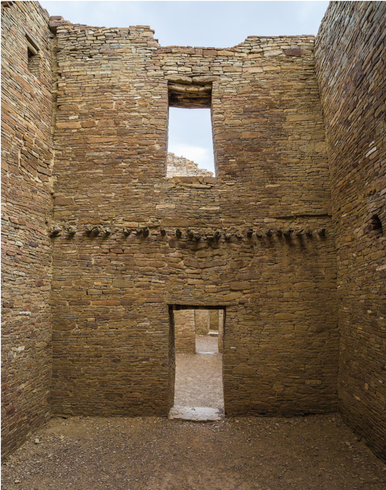
Chaco builders were masterful architects and highly adept at utilizing native stone—the first record of its use by local natives. While many doorways and windows were situated to mark the passage of the sun, it seems the Chacoans also tracked the movements of the moon. The smaller spiral at the Sun Dagger site records major moon movements, and some buildings are aligned with the 18.6-year cycle of minimum and maximum moonrise and moonset. If nothing else, Chaco reveals a fascinating and complex fusion of the practical and the spiritual: a way of living life as well as divining its purpose.