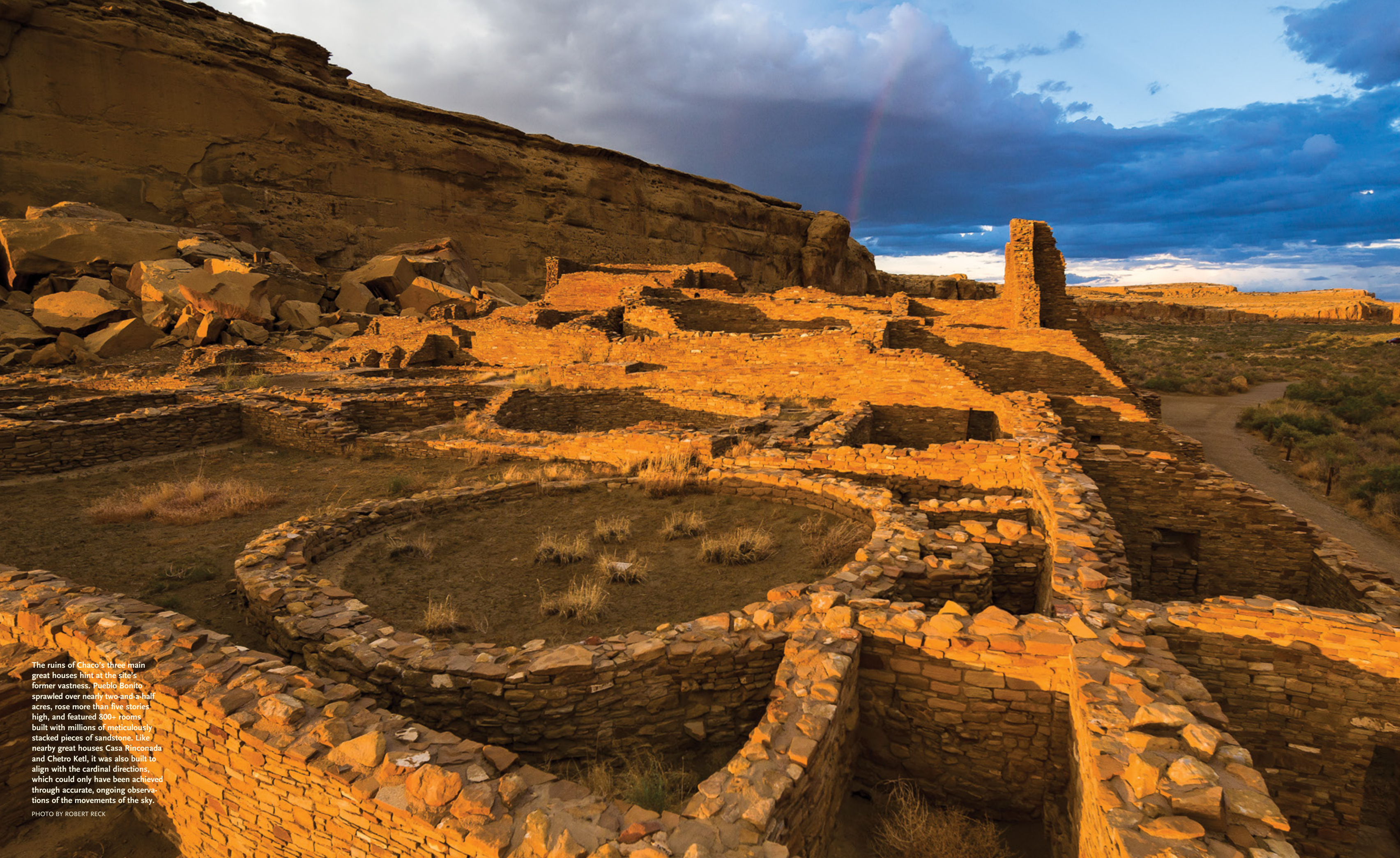
The ruins of Chaco's three main great houses hint at the site's former vastness. Pueblo Bonito sprawled over nearly two-and-a-half acres, rose more than five stories high, and featured 800+ rooms built with millions of meticulously stacked pieces of sandstone. Like nearby great houses Casa Rinconada and Chetro Ketl, it was also built to align with the cardinal directions, which could only have been achieved through accurate, ongoing observations of the movements of the sky.